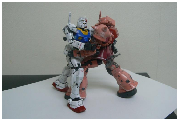
Fig. 1 Gundam and Zaku locked in battle in a gappuri-yotsu -like position ( gappuri-yotsu is a sumo hold in which two wrestlers are locked together, each with a firm grip with both hands on the other's belt)

•However, achieving autonomous motion of a humanoid robot even at human-size remains a serious research challenge, to which enormous time and effort continues to be invested. It would therefore be very difficult to achieve autonomous movement of an 18 m-high, 40-ton robot by 2019.